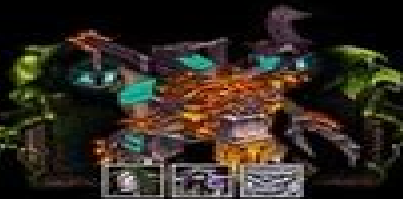
ANCIENT OF LORE