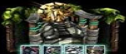
ALTAR OF ELDERS