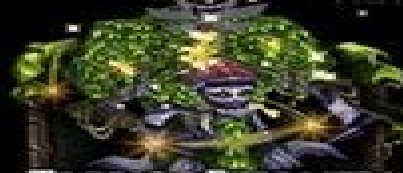
TREE OF ETERNITY