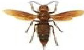
Asian Giant Hornet