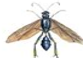
Common Blue Mud Dauber Wasp