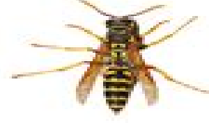
European Paper Wasp