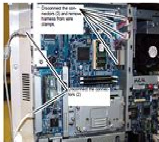
Figure 1 Disconnecting the connectors on the ESS PWB