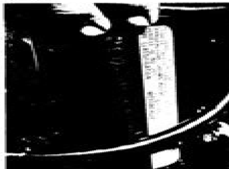
Frame serial number location

In order to prevent possible confusion when ordering parts, always refer to the engine and frame serial numbers. The frame number is stamped on the right side of the steering lug, while the engine number is located on a raised boss just behind the right cylinder on the top of the crankcase.