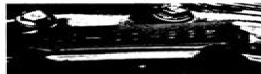
Engine serial number location