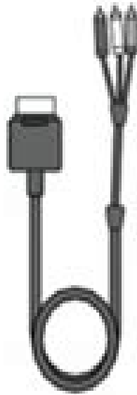
Composite AV cable