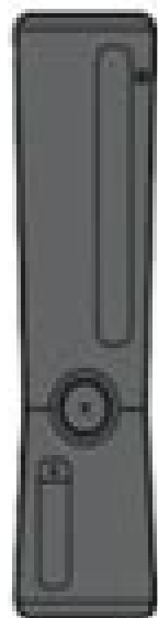
Xbox 360 Console with hard drive