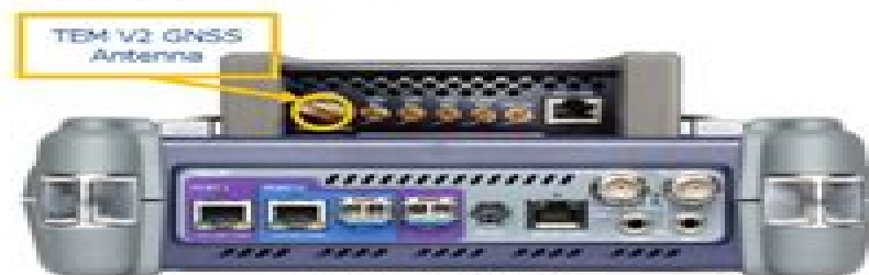
Figure 2: TEM V2