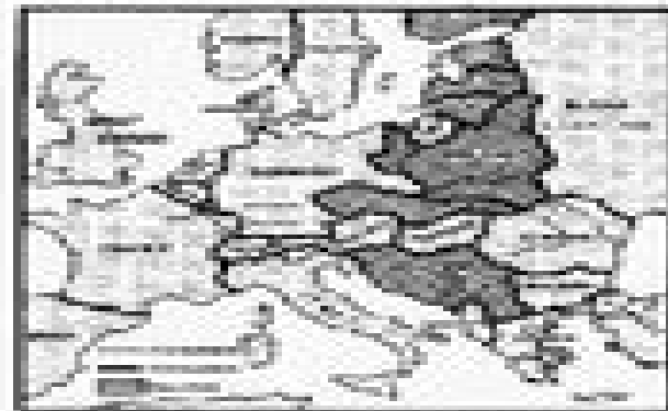
EUROPE AFTER WORLD WAR I