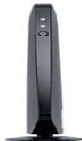
Fios Quantum Gateway