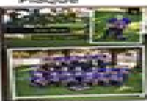
8x10 Memory Mate Plaque

Most items have the player's name printed on it. PRINT NEATLY!!!! Reprints due to poor penmanship is at your expense.