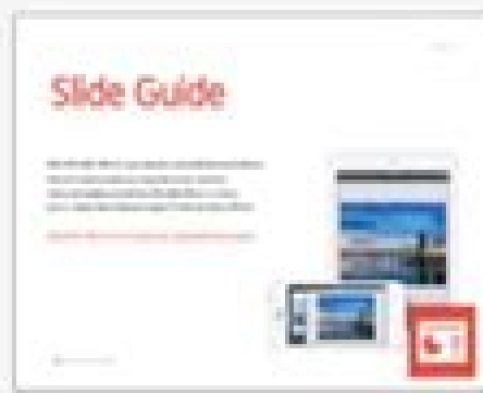
Slide Guide.pptx 2014-05-12 15:12