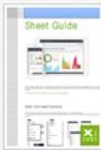
Spreadsheet Guide.xlsx 2014-05-12 15:10