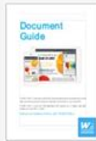
Document Guide.docx 2014-05-12 14:08