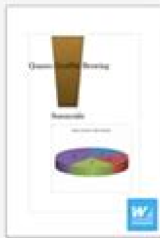
QGB.docx 2014-05-08 15:53