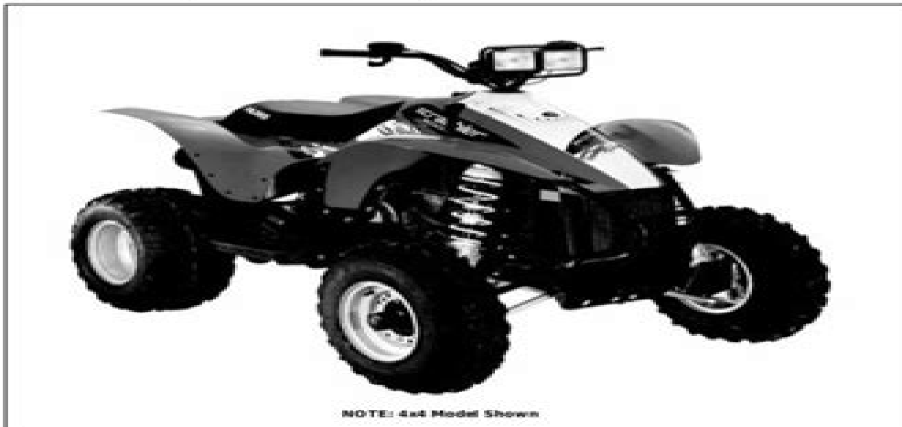
NOTE: 4x4 Model Shown