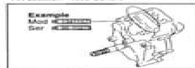
Transmission I.D. Numbers