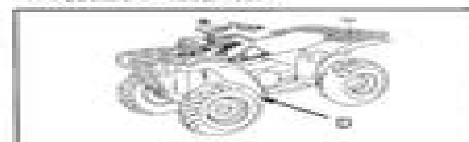
VIN Location - 1998-Current