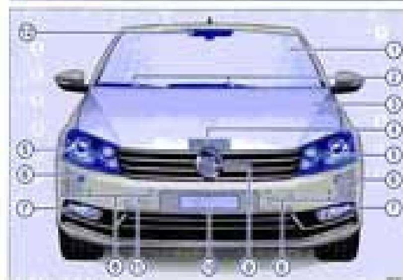
Вид 2. Вид автомобиля спереди