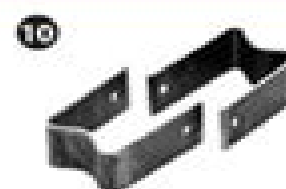
LG-Brackets - weld on