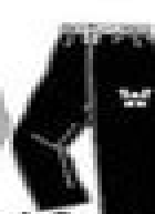
#10 BLACK SWEATPANTS PRINT