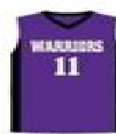
#12 Jersey BLACK & Purple

Name: _____ Teacher: _____ Room #: _____