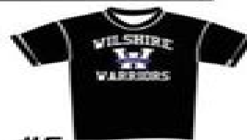
#5 BLACK T-SHIRT - DRYFIT