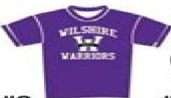
#2 PURPLE T-SHIRT - COTTON