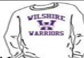
#4 WHITE LONGSLEEVE T