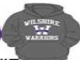
#7 DK GREY HOODY PRINT