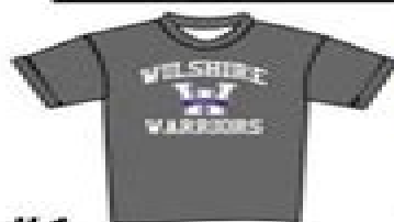
#1 DK GREY T-SHIRT - COTTON

NO REFUNDS OR EXCHANGES DUE TO INCORRECT SIZING