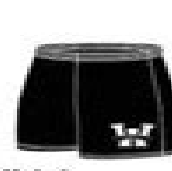
#11 BLACK DRYFIT SHORTS - PRINT