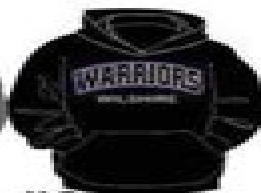
#8 BLACK HOODY EMBROIDERY