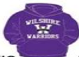
#6 PURPLE HOODY PRINT