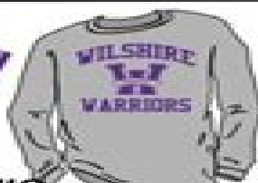
#3 GREY LONGSLEEVE T