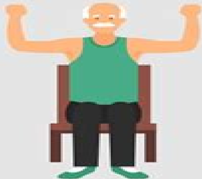
Do The Peekaboo