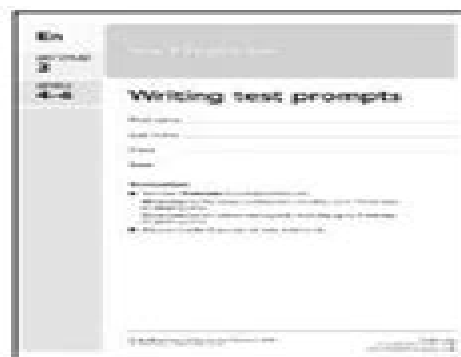
Writing test prompts