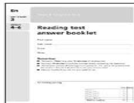
Reading test answer booklet