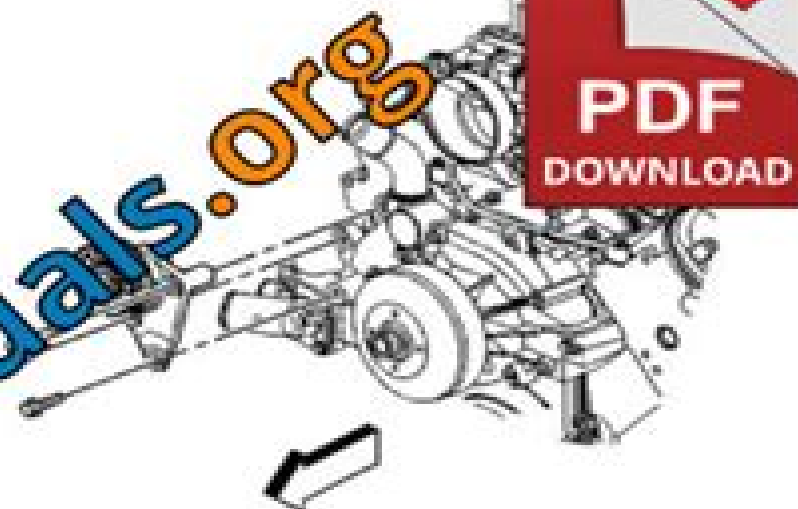
Fig. 13: View Of Drive Belt Tensioner & Belts