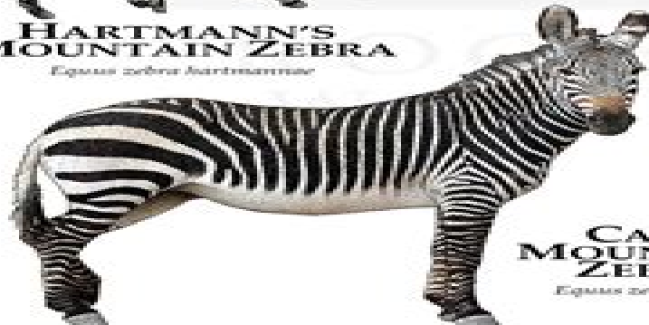
CAPE MOUNTAIN ZEBRA