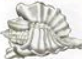
Foliate Thornmouth (W)

Nassarius channelis To 2 in. (5.1 cm) high Large yellow-brown to yellow-gray shell has deep, beaded ridges and a pointed apex.