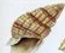
Three-lined Nassa (E)

Macrosipha carolinensis To 2 in. (5.1 cm) Large, brown shiny and shell is white-spotted. Note prominent teeth lining central opening.