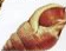
Channeled Nassa (CA)

Scaphella junonia johnstonensis To 3 in. (7.6 cm) Deep water Gulf Coast shell only reaches up on shore after storms. Alabama's state shell.