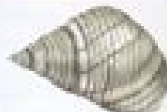
Marsh Periwinkle (CB,V)

Euryspira caudata To 1.5 in. (3.8 cm) high Small shell has a pointed apex and spiral ridges. Feeds primarily on oysters.