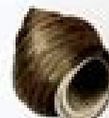
Common Periwinkle (B,V)

Euryspira angulata To 1 in. (2.5 cm) high Shell has 8-10 deep, blade-like ribs.