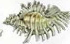
Lace Murex (CB)

Cerithium foliatum To 1.5 in. (3.8 cm) high Shell has three large, leaf-like flanges. Color varies from white to dark brown depending on location.