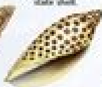
Johnstone's Junonia (CB, CB)

Nassarius trilineatus To 1 in. (2.5 cm) high Whitish shell has 4-6 beaded spiral ridges. Southern specimens often have 3 spiraling red brown lines.