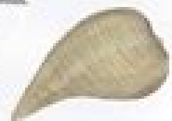
Common Fig Shell (CB)

Hydrobia ulitiformis To .75 in. (2 cm) Very fragile white to yellowish shell has a delicate lip. Shells are so light they are often transported to the highest tide line.