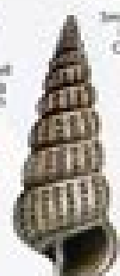
California Horn Snail (CAS)

Chamaelea pumila To 4.5 in. (11.4 cm) Yellow-white to brownish shell has raised ribs but lacks long spines. Note brown spots on outer lip of shell.