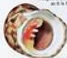
Bleeding Tooth (CB)

Hydrobia ulitiformis To 1 in. (2.5 cm) Brown to white shell has body seal frills and spines. Species found in aquatic waters have smoother shells. Found in intertidal waters.