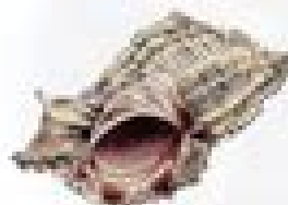
Carinate Downshell (W)

Chamaelea lamarckii To 2 in. (5.1 cm) Elaborate pinkish-white to brownish shell with long flaps.