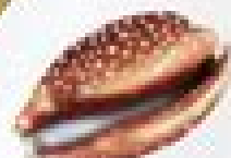
Atlantic Deer Cowrie (CB,CB)

Olivella septentrionalis To 2.5 in. (6.3 cm) Glossy, yellow to grayish cylindrical shell has markings that resemble lettering. South Carolina's state shell.