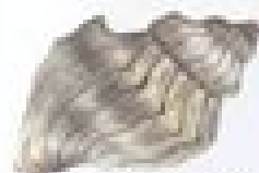
Frilled Dogwhelk (W)

Collispira ligatum To 1 in. (2.5 cm) high Pearl-like, strongly ridged shell is as wide as it is high.