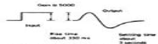
Fig. 1.2. System response to a step function.

C , the last period of the receive interval.