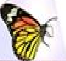
Image after enlargement