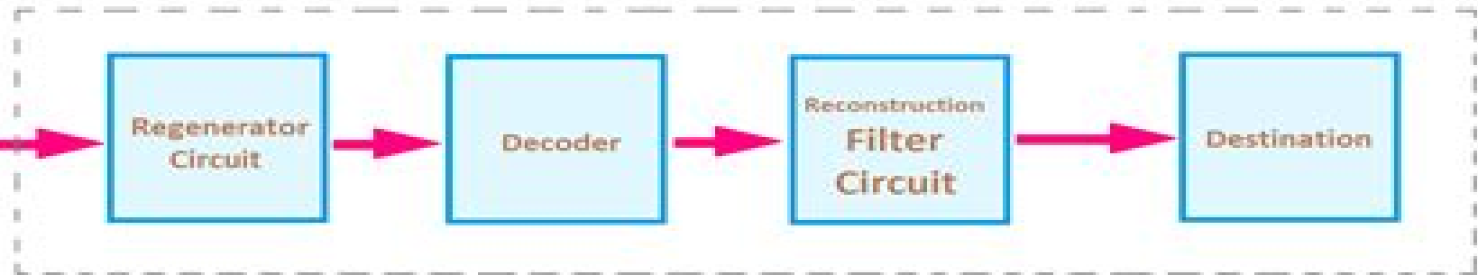
Block Diagram of PCM System