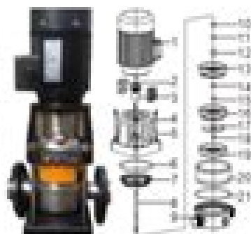
Fig. 3-36 Additive pump

As shown in Fig. 3-36 on page 3-39, additive pump is composed of motor, pump head, guidance blade, impeller, pressure proof tube, water in & out section, pump shaft, mechanical sealing, etc. It has features of high efficiency, low noise, light-corrosion proof, compact structure, nice shape, small volume, light weight, convenient use and maintenance, relative sealing, etc.