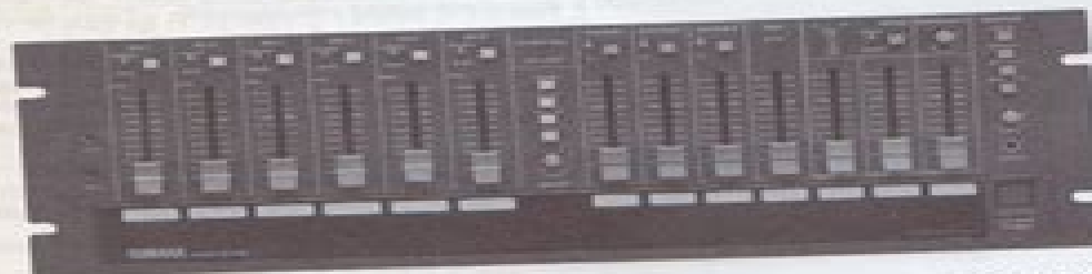
U.S., CANADIAN, U.K. & GENERAL EXPORT MODELS