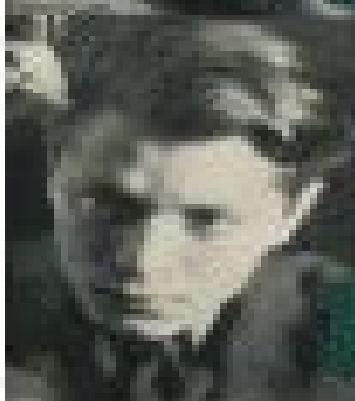
Delmore Schwartz and Others