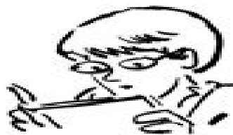
_____ estudiosa _____