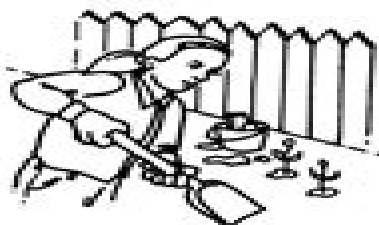
_____ trabajadora _____