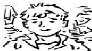
_____ desordenado _____