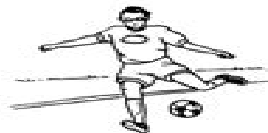
_____ deportista _____