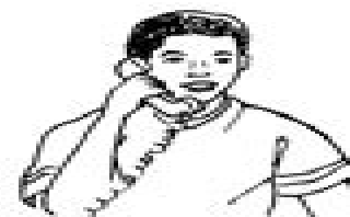
_____ sociable _____