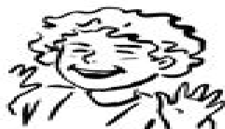
_____ graciosa _____