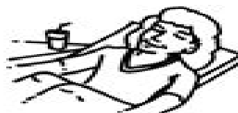
_____ perezosa _____