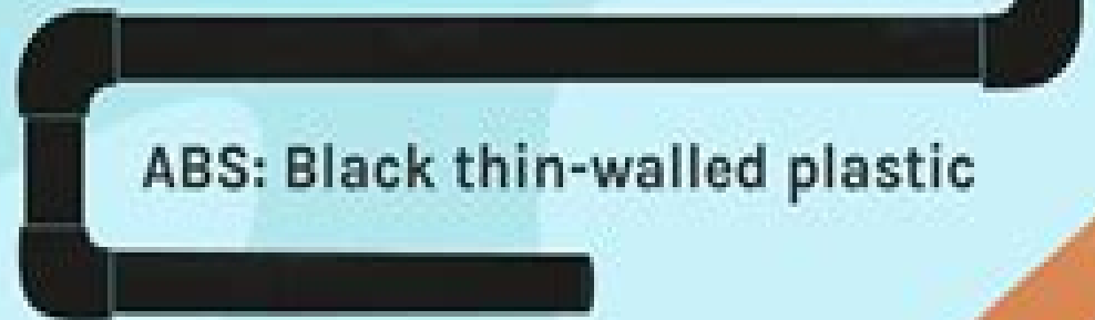
ABS: Black thin-walled plastic