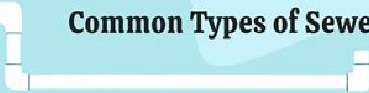
PVC: White thin-walled plastic