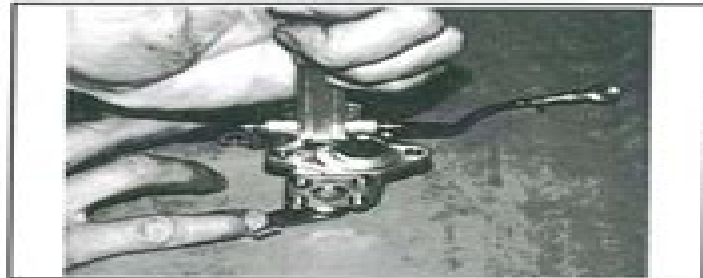
• MEASUREMENT B

NOTE: On 550 engines, make sure the gasket is installed on the oil pump before taking measurement.