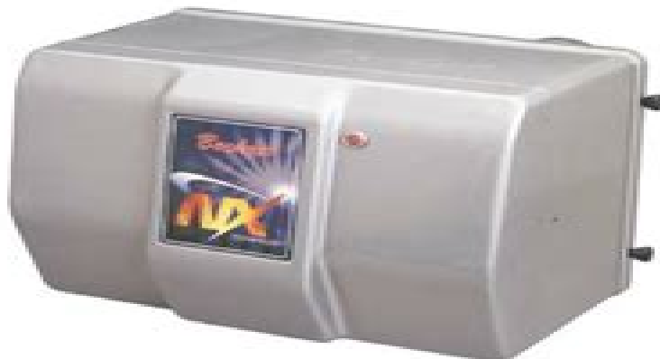
NX Burner Cover