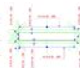
4. Level 2 rectangular opening