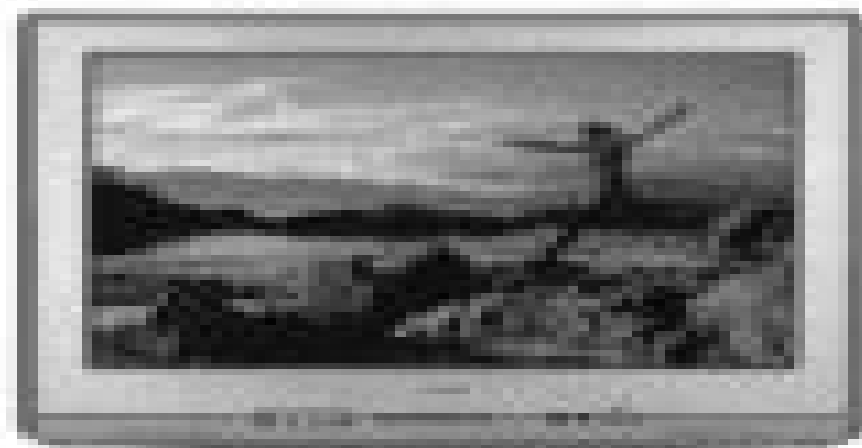
Projection size: 28" with a 20" screen