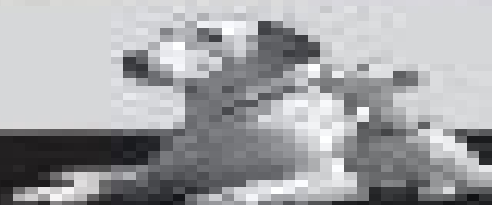
Channel Store: A collection of channels for easy access.