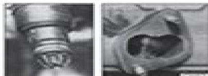
How to reduce typical carbon deposits (found on fuel injectors and intake valves) that can cause drivability problems. Engine Management—Drivability, page 7