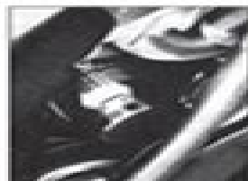
See how to perform routine maintenance procedures, such as changing the oil filter. Lubrication and Maintenance, page 10

Though the do-it-yourself Volkswagen owner will find this manual indispensable as a course of the detailed maintenance and repair information available at an authorized Volkswagen dealer, the Volkswagen owner who has no intention of working on his or her car will find that reading and owning this manual will make it possible to discuss repairs more intelligently with a professional technician.