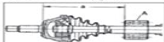
Detailed view showing correct spacing (A) between constant velocity joint and axle vibration damper (B). Suspension and Steering, page 22