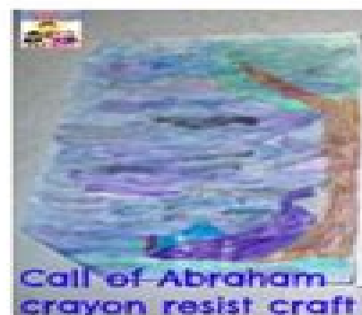
Call of Abraham crayon resist craft

from "In the Beginning" to Joseph's big reveal