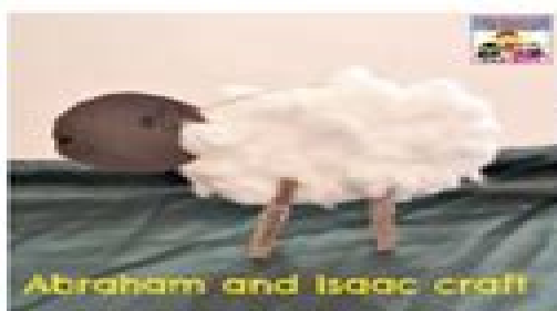
Abraham and Isaac craft