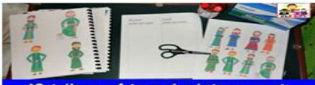
10 tribes of Israel coloring page