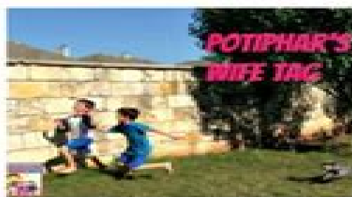
POTIPHAR'S WIFE TAG