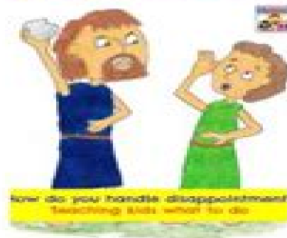
How do you handle disappointment? Teaching kids what to do