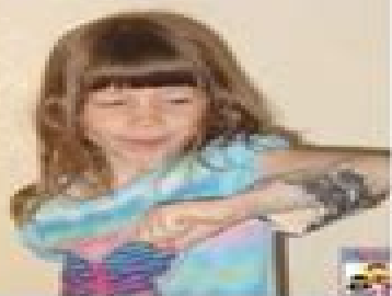
Marriage of Isaac and Rebekah craft