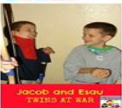
Jacob and Esau TWINS AT WAR