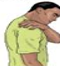
Joint and Muscle pain