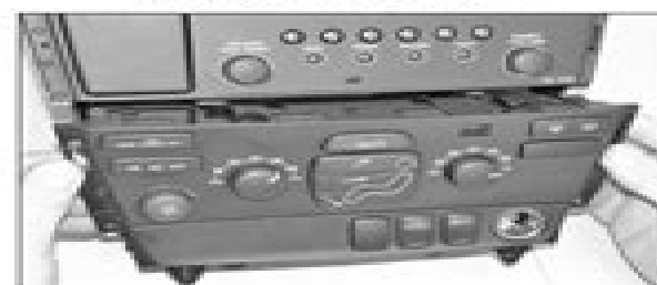
10.11b ... and withdraw the control panel