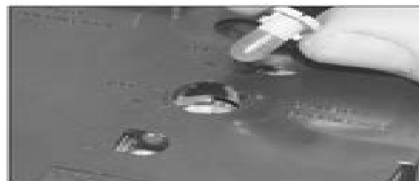
10.7b ... and pull out the bulb and holder

then release the 6 catches and remove the panel surround (see illustrations).