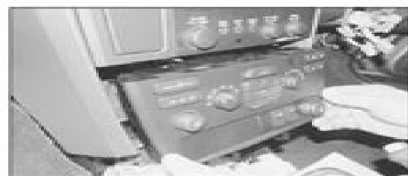
10.4b ... then pivot the panel up and unhook it

5 Disconnect the wiring plugs as the panel is withdrawn.