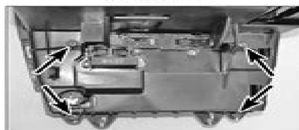
10.11a Undo the 4 Torx screws (arrowed) ...