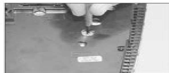
10.7a Unscrew the bulbholder from the rear of the panel ...