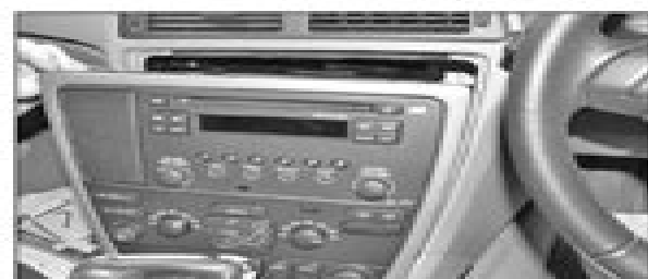
10.9b ... and pull the complete infotainment and dashboard environment panel from place

10 Undo the 3 screws at the top of the panel.