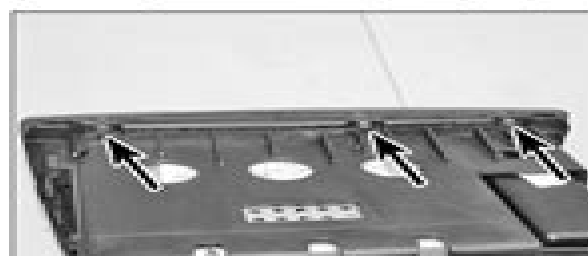
10.10a Undo the 3 Torx screws (arrowed) ...

12 If required, the front panel can be removed by releasing the catches and pulling the panel