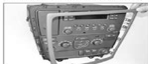
10.10c ... and detach it from the panel