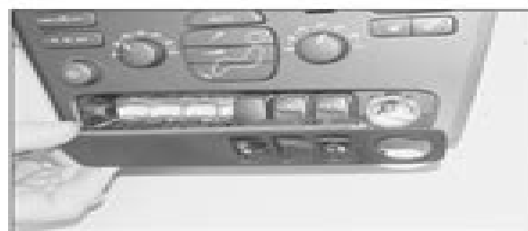
10.6 Unclip the switch panel