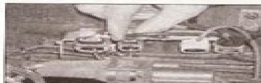
B Unclip the plastic cover from the centre of the bulkhead and check that the engine management system wiring connectors are all securely joined.