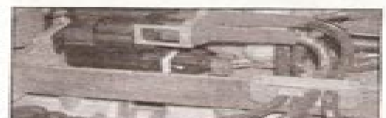
C1 If possible, remove the engine cover to ...