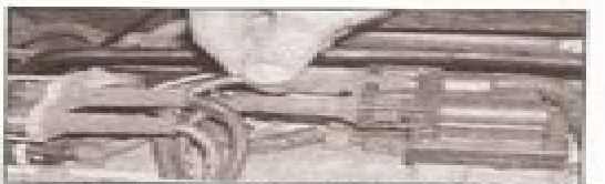
C3 ... and the HT leads (non-GDI engines) are securely connected to both the coils and spark plugs.