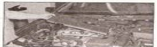
C2 ... check that the ignition coil wiring connectors are securely connected ...

Check that electrical connections are secure (with the ignition switched off) and spray them with a water dispersant spray like WD-40 if you suspect a problem due to damp.