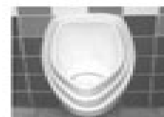
Figure 1. Typical Cartridge-Type Urinal.

Like ordinary urinals, waterless types are plumbed to a standard drain line, but obviously do not use a conventional water-filled trap. Waterless urinals utilize proprietary sealant liquids that act as a vapor trap. The liquids are composed primarily of natural oils that are lighter than water. Urine passes through this liquid and goes down the drain. The