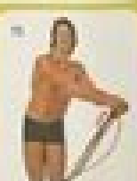
15 SHOULDERS and arms

Stand with feet shoulder-width apart, holding the handles of the Bullworker in front of your chest. Pull the handles towards your chest, squeezing your shoulder blades together. Hold for 10 seconds. Repeat 10 times.