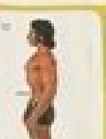
13 SHOULDERS and arms

Stand with feet shoulder-width apart, holding the handles of the Bullworker in front of your chest. Pull the handles towards your chest, squeezing your shoulder blades together. Hold for 10 seconds. Repeat 10 times.