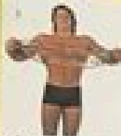
1 CHEST, shoulders and arms

FIRST WEEK Complete exercise 1 to 7 every day SECOND WEEK Complete exercise 1 to 7 every day and add three more exercises each day.