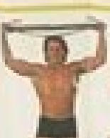
5 SHOULDERS and arms

Stand with feet shoulder-width apart, holding the handles of the Bullworker in front of your chest. Pull the handles towards your chest, squeezing your shoulder blades together. Hold for 10 seconds. Repeat 10 times.