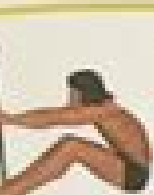
6 SHOULDERS and arms

Stand with feet shoulder-width apart, holding the handles of the Bullworker in front of your chest. Pull the handles towards your chest, squeezing your shoulder blades together. Hold for 10 seconds. Repeat 10 times.