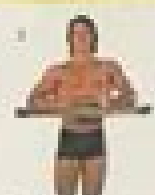
2 CHEST, shoulders and arms

Stand with feet shoulder-width apart, holding the handles of the Bullworker in front of your chest. Pull the handles towards your chest, squeezing your shoulder blades together. Hold for 10 seconds. Repeat 10 times.