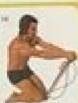
14 SHOULDERS and arms

Stand with feet shoulder-width apart, holding the handles of the Bullworker in front of your chest. Pull the handles towards your chest, squeezing your shoulder blades together. Hold for 10 seconds. Repeat 10 times.