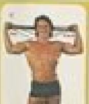
11 SHOULDERS and arms

Stand with feet shoulder-width apart, holding the handles of the Bullworker in front of your chest. Pull the handles towards your chest, squeezing your shoulder blades together. Hold for 10 seconds. Repeat 10 times.