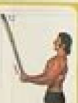
12 SHOULDERS and arms

Stand with feet shoulder-width apart, holding the handles of the Bullworker in front of your chest. Pull the handles towards your chest, squeezing your shoulder blades together. Hold for 10 seconds. Repeat 10 times.