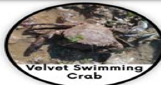
Velvet Swimming Crab