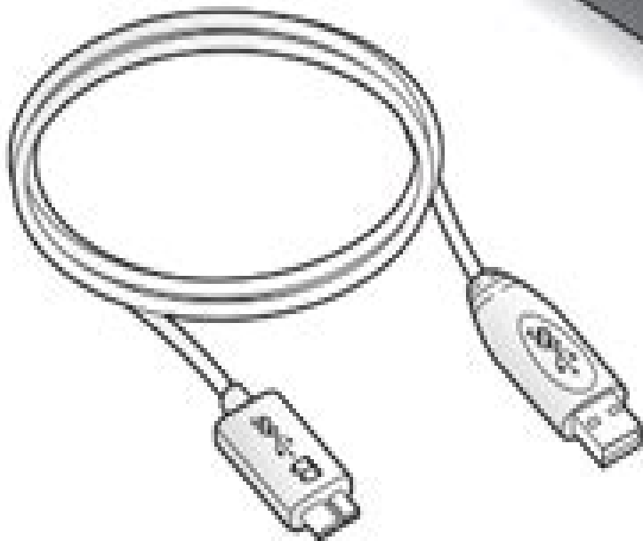
Detachable USB 3.0 Cable