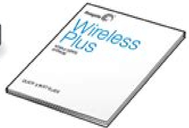
Quick Start Guide