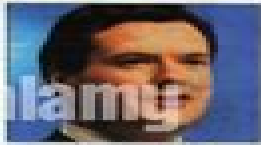
Tax pledge ... George Osborne