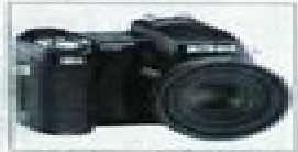
Camera ... sold for £1,000