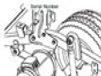
Fig. 3 Serial Number on Rear Frame

Before a new vehicle is put into operation, the items shown in the Service Checklist chart must be performed (Ref. Fig. 4).