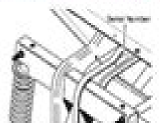
Fig. 2 Serial Number on Front Frame