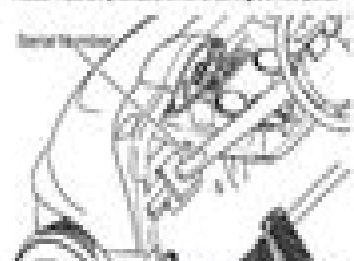
Fig. 1 Serial Number Location on Steering Column

In order to obtain correct components for the vehicle, the manufacture date code, serial number and vehicle model must be provided when ordering service parts.