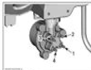
FIGURE 1 1. Connect fuel hose. 2. Connect fuel hose. 3. Connect fuel hose. 4. Connect fuel hose.