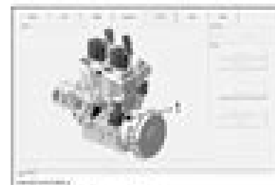
FIGURE 1 1. Press on oil pump.