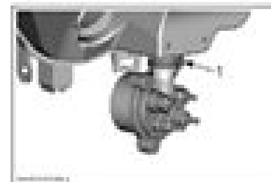
FIGURE 1 1. Center clamp