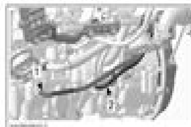
FIGURE 2 1. Connect fuel hose. 2. Connect fuel hose.