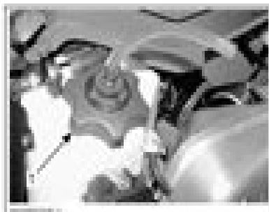
FIGURE 1 1. Location of oil