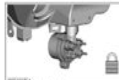
FIGURE 2 1. Rotate oil pump 90 degrees.