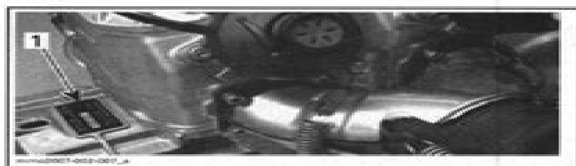
TYPICAL — 500SS AND 600 HO SDI ENGINES 1. Engine serial number