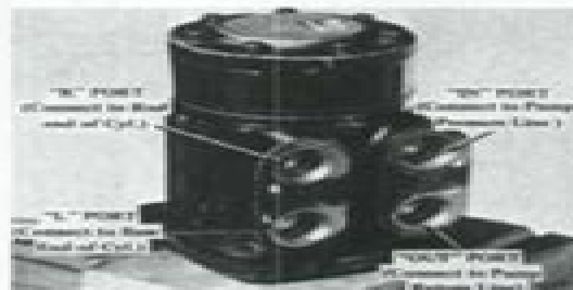
Fig. 8 - View of steering control valve showing port locations. Pressure tube from pump connects to "IN" port; return tube to pump connects to "OUT" port; tube to rear end of cylinder connects to "L" (left turn) port; and tube to rod end of cylinder connects to "R" (right turn) port.

CAUTION: Make sure restrictor valve on flow-tester is in open position as there is no relief valve protection.