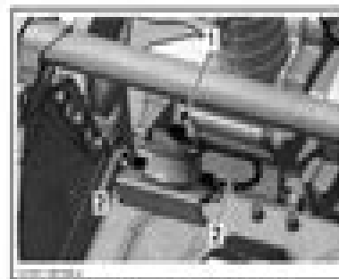
REAR ENGINE SUPPORT