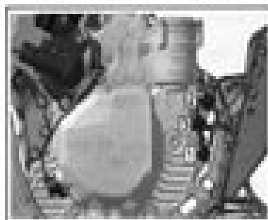
FRONT ENGINE SUPPORT