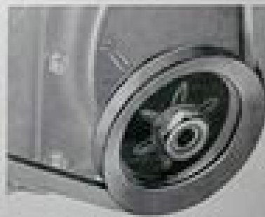
FIG. 14 - TIMING MARKER

47½ pounds at 14 inches above the outlet at an engine speed of 1400 rpm. The maximum pressure is 47½ pounds (see Page 27) for complete information regarding the fuel pump.