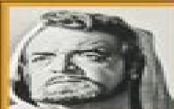
VAN HEFLIN as Barabbas