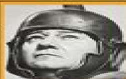
JOHN WAYNE as The Centurion