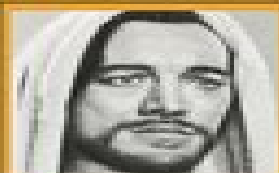
MAX VON SYDOW as Jesus