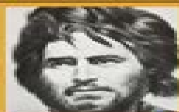
CHARLTON HESTON as John the Baptist