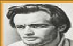
DAVID MCCALLUM as Pontius Pilate